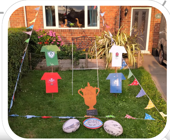
Runner-up (above): Rugby World Cup