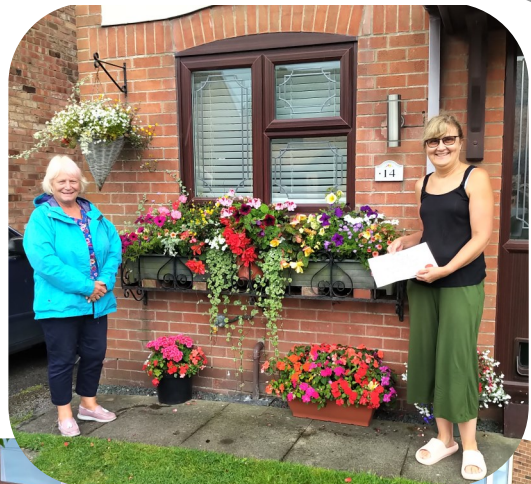
Garden Winners (above clockwise): Hanging Baskets Window Box & Planters