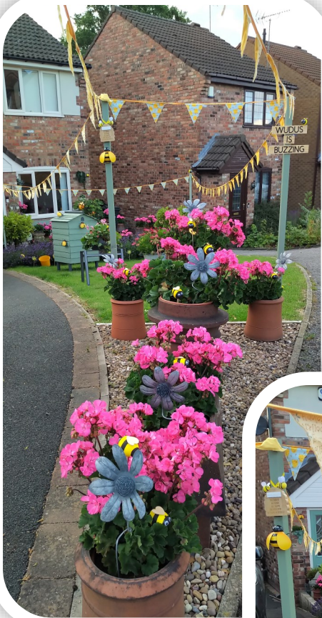
Winner (left & below): Wudhus is Buzzing

This year the competition was so tough that the judges created a new segment for the Street Scene competition called Best Themed Front Garden. There were several gardens that were decorated but didn't fall into the Bunting or Scarecrow categories. Great to see that HW is getting so creative and something we would like to continue for the future.