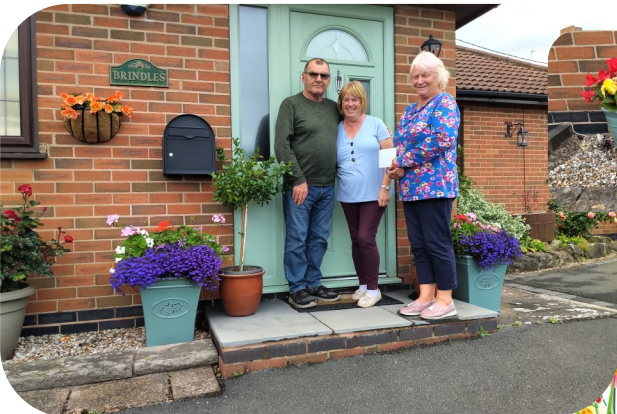
Garden Runners-up (top left clockwise): Hanging Baskets, Window Box & Planters