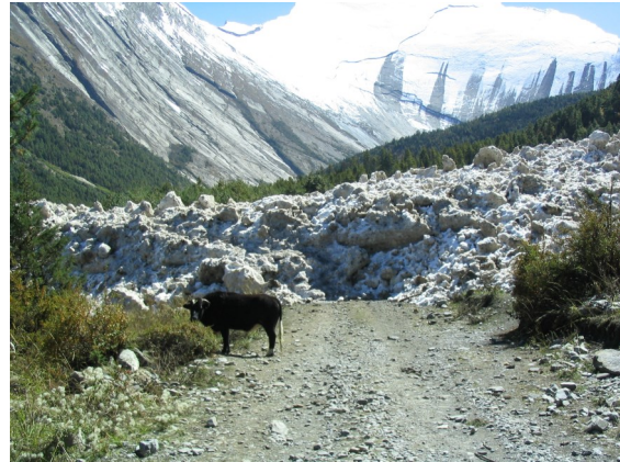
An avalanche blocking the path near Humde (10,760ft) (19/10/14)