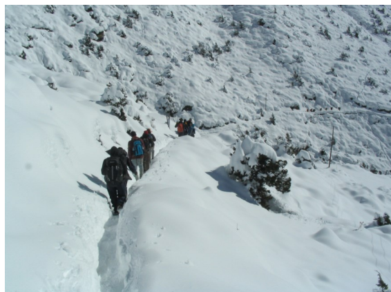
Trekking from Siri Kharka (12,800ft) the day after the snowfall (15/10/14)

Fortunately, Tulasi is a very experienced guide and he recommended that we return to a lodge at 12,800 feet because snow was expected the next day and it meant that we were back below a hazardous section of the path. Sure enough the snow came – about four feet of it in 12 hours where we stayed and almost twice as much higher up.