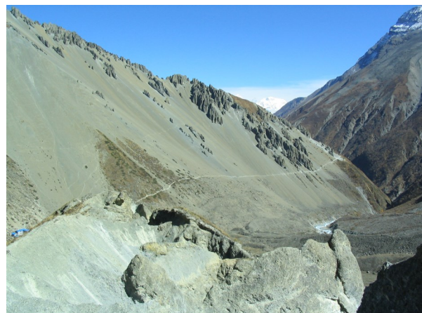
Path to Tilicho Basecamp (13,615ft), before it was swept away by an avalanche (12/10/14)