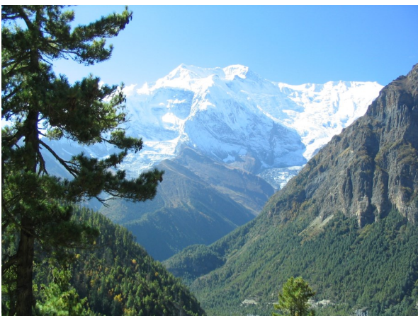
Annapurna II (26,046ft) from Upper Pisang (08/10/14)