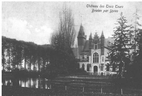
Chateau Trois Tours, Brielen near Ypres

"8 th /9 th July 1916: 3 rd Coldstream 'minenwerfered*' at about 5am, otherwise quiet night. Various Royal Engineer and Right Group commanders came in. 3 rd Coldstream 'minenwerfered' again about 3pm. Heavy retaliation put over which eventually stopped it. Wilmot-Sitwell very badly wounded and died in the Dressing Station at Essex Farm. Quiet evening until about 11pm when heavy bombardment opened south east of Ypres and lasted 2 hours, the sky being lit with shells. This turned out to be the Canadians making an unsuccessful attempt to get back a strong point near Hooge".