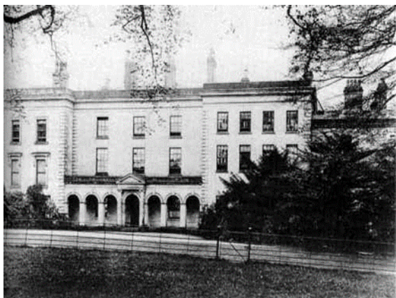
Stainsby House, North side

He attended Eton Public School in 1907 and went up to Christ Church College, Oxford in 1911. By the summer of 1914 and the start of the First World War he was at the Royal Military College, Sandhurst. On the 17 th of February 1915, he was commissioned in the Coldstream Guards and reported to the Victoria Barracks, Windsor on the 1 st