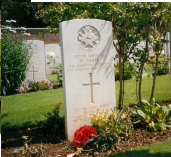
Bill White’s headstone – Anzio War Cemetery