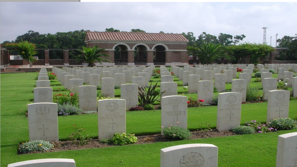
Anzio War Cemetery