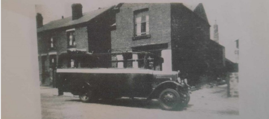
Uknown Bus Company - nr the present fish and chip shop, Main St.

Also close to Peony’s there were premises from where a local Bus Service operated. The interesting story here is that when petrol rationing was introduced in WW2, this bus had a large bag fitted to the roof and it was filled with gas from a tap high on the wall of the Peony building. A bag full of gas was sufficient to travel to Derby and back again. A journey not without its share of safety concerns one would imagine!