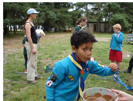
Beavers eating fresh fruit heated on a fire and dipped in chocolate

1st Sitwell Scout group had a great camp. All sections of the Scout group went to Sherbrook campsite in Nottinghamshire. We had 42 members of the Scout Group made up from the Beavers, Cubs, Scouts and leaders. This was the first time 1 st Sitwell Beavers were able to camp in tents since they reopened in February. During the weekend the Scout Group did archery, black hole, go-carting, den making, had a water fight, fire lighting and open fire cooking, campfire singing, rocket making and of course games.