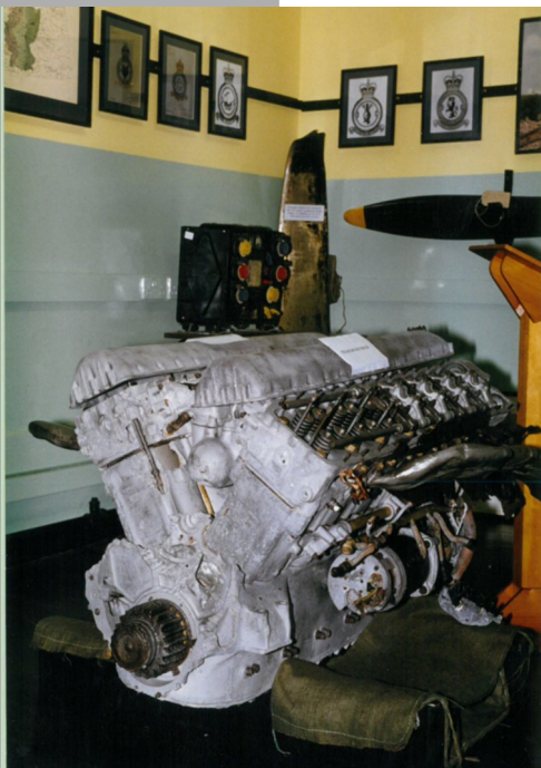
Crash damaged Merlin engine – originally fitted in a Lancaster Bomber, Recovered from Valley Farm, Heage in the 1980's this engine was probably "dumped" whilst clearing up at Bowmer & Kirkland's yard at the end of engine stripping operations

garage) was moved onto the Clan Foundry site at Belper were the Meteor tank engine was 'off the drawing board' stage. The initial batch of 25 were being put together by sub-contractors, the second batch were built on site. These engines went into the British Armies new Cromwell tank which was to figure in the campaign through France and Belgium and up to the Rhine in the months to come.