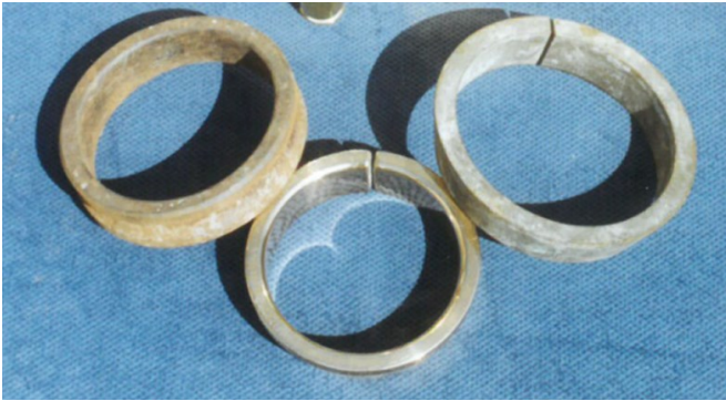
Surviving Merlin engine components

now engines were stacked two and three high in Booth's orchard so space was taken at Belper Railway Goods Yard and also at Blounts, some were even located in the area around No.2 site where local miners helped in the dismantling.