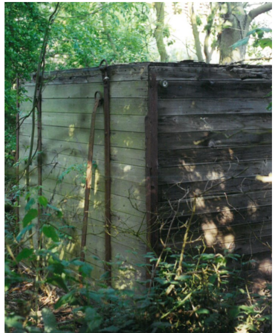
Merlin engine packing case, used cases were sought after for garage and chicken shed construction (this one is thought to be a Packard Merlin case)

By now the workforce had acquired various equipment to assist them in the operation, transport was always at a premium and even George Marshall's wheel barrow was pressed into service, a short wheel base Bedford was hired from Bowmer and Kirklands c/w driver and he stayed till the end of the war running between sites moving parts. The flow of parts from no.2 site (now Kelf's