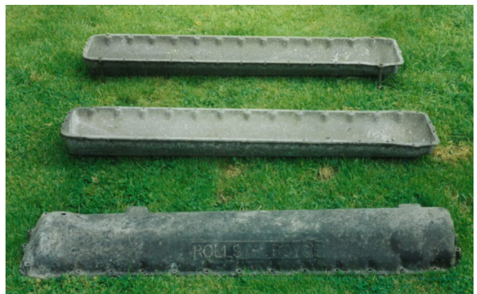
Merlin engine rocker covers – much used in the village as chicken feed and water troughs