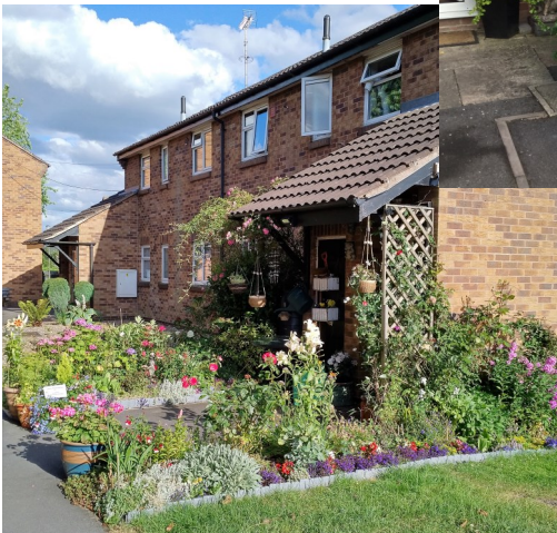
Most appealing: Window Boxes, Hanging Baskets, Planters, Front Garden (clockwise from the top left)