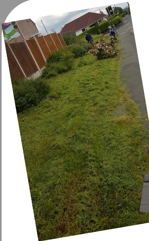
(left) During the grass cutting and (below) afterwards - looking very nice.