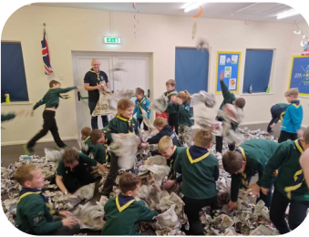
Cubs making guys for the bonfire event.

long day and night and the Network Team who helped at the event this year too. Photos are on our bonfire Facebook page https://www.facebook.com/groups/1470496443259254 . Hope you had fun and I hope to see you next year.