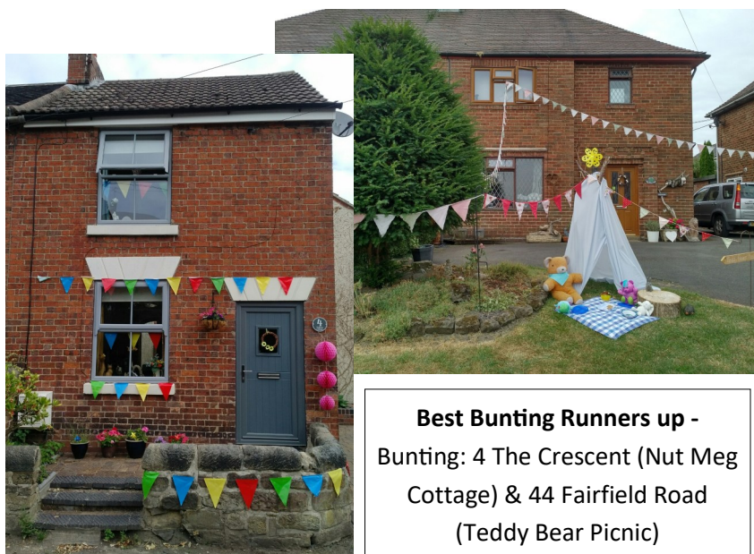
Best Bunting Runners up - Bunting: 4 The Crescent (Nut Meg Cottage) & 44 Fairfield Road (Teddy Bear Picnic)