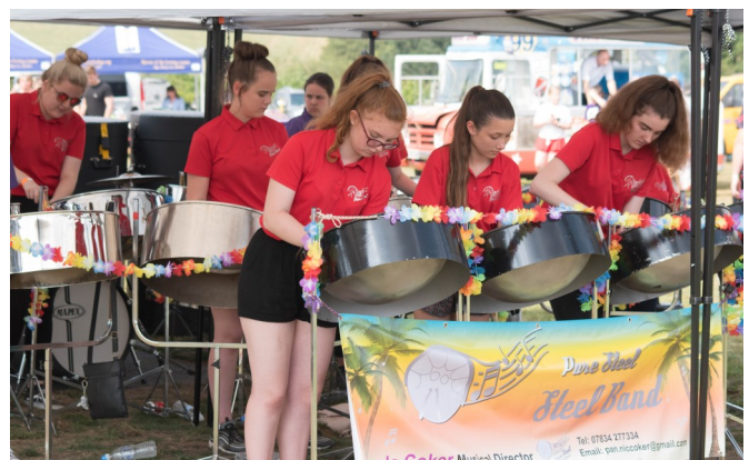
Heanor Gate Steel Band

We didn't manage to attract any budding young photographers this year but the adult entries for the photograph competition showed the art of photography is still going strong.