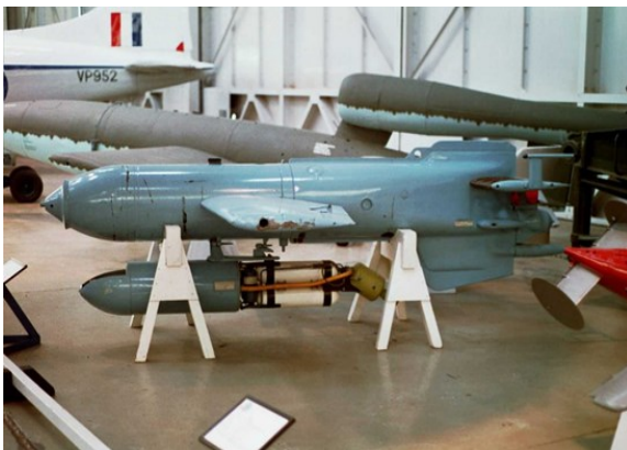
Hs 293 Glider Bomb

The Dulverton continued to give sterling service and was eventually deployed in defence of Leros in 1943. On the 13th Nov 1943, the Dulverton was engaged by German Dornier Do. 217 aircraft off the island of Kos and was struck by an Henschel Hs 293 Glider bomb launched from one of the planes (the Hs 293 was a joystick controlled short winged glider bodied bomb with an underslung rocket engine and a 295 kg high explosive