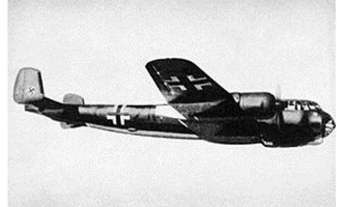
Dornier Do 217 aircraft

Dulverton supported the other three destroyers whilst they made a sustained depth charge attack on the U-Boat. U559 was finally forced to surface after which all four ships engulfed the U-Boat with gunfire. A boarding party was sent by HMS Petard with orders to recover the U-Boat’s