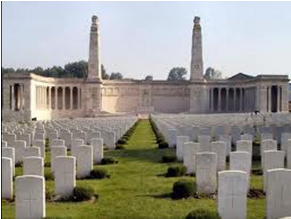
Memorial to the Missing of the 1918 Advance in Picardy, Viz-en-Artois Cemetery, Arras-Cambrai Road

Fighting continued on the Western Front with American troops now involved. The Allies went on to achieve significant breaches of the Hindenburg Line pushing the Germans back with each passing day. By early November 1918, the British found themselves fighting once again at Mons (Belgium) where it had all begun some 50 long months before. The German Army and establishment were now in a state of collapse; on the 7 th November, General Ferdinand Foch (Supreme Commander, Allied Forces) met German marshals and politicians in a railway carriage in the Forest of Compiègne, Northern France. The German military elite and their more moderate political representatives had little choice but to accept the Allies' terms. On November the 11 th 1918 at 11am, fighting finally ceased on the Western Front.