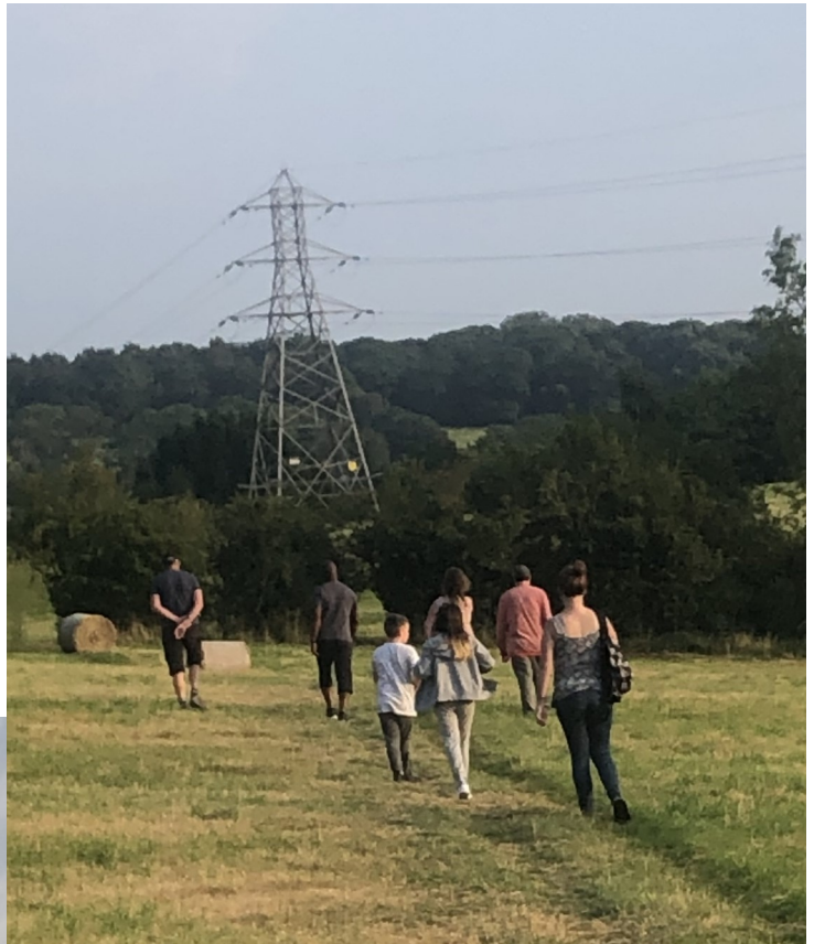
Fields surrounding Horsley village