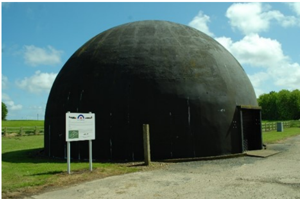
Langham Dome, Norfolk

Historically, Norfolk was the location for several WW1 and many WW2 RAF and latterly, USAAF bases. Just down the road from our new house is the site of the former RAF Langham. Opened originally in 1940 as a