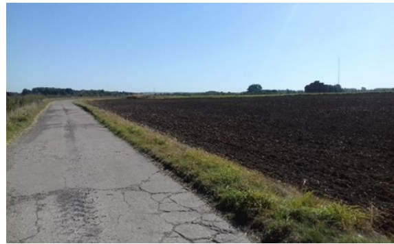
Returned to the plough – perimeter track, former RAF Ludford Magna, Sept. 2019

Backtracking a little, in September 2019, some three months before our move, Sue and I headed NE for a day out on the north Lincolnshire coast. On the way we stopped at Ludford Magna to visit the location of the former WW2 RAF Bomber Command Station, wartime home to 101 Squadron. Little remains of the airfield today, the land has practically all been returned to the plough. It was a warm sunny day, little stirred save a gentle breeze rustling in the trees and hedgerows, birds whistled and 'flipped' about the pleasant rural scene; even so, as we walked a section of the still sound peri-track, I could almost hear the shouts and clangs, the bustle of a wartime operational bomber base, the roar of Merlin's on a late August evening in 1943, the evening on which Sergeant Cecil Bardill took off on what turned out to be his last ever flight, his last journey in this world.....RIP.