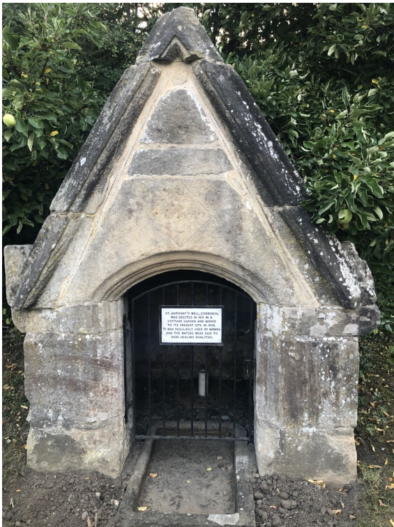
St Anthony's Well, Coxbench