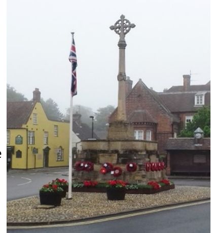
Holt War Memorial