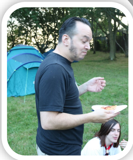
One of the Leaders enjoying the food on offer, a little too much!

Keep an eye out as we have a couple of social media competitions this year, one before and one during the bonfire event, great prizes to be won too. Please share the page and of course the event and hope to see you there.