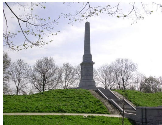
49 th (West Riding) Division Memorial, Essex Farm Cemetery, Boesinghe, Ypres Salient