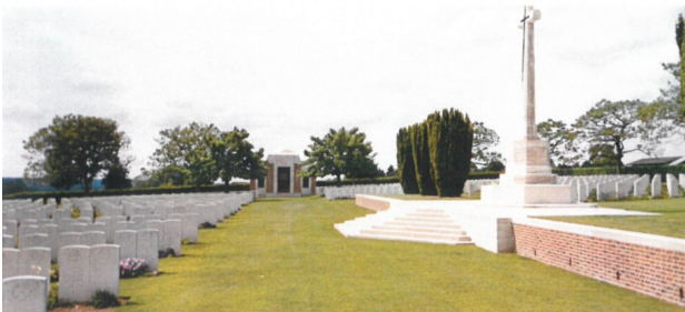
Abbeville Communal cemetery with the extension on the left

Up to September 1916, Abbeville Communal Cemetery was used for military burials. The cemetery extension was established and used thereafter.