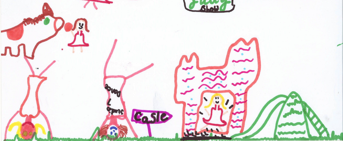
Poster Competition Winners - E Feeney & Y Yelland